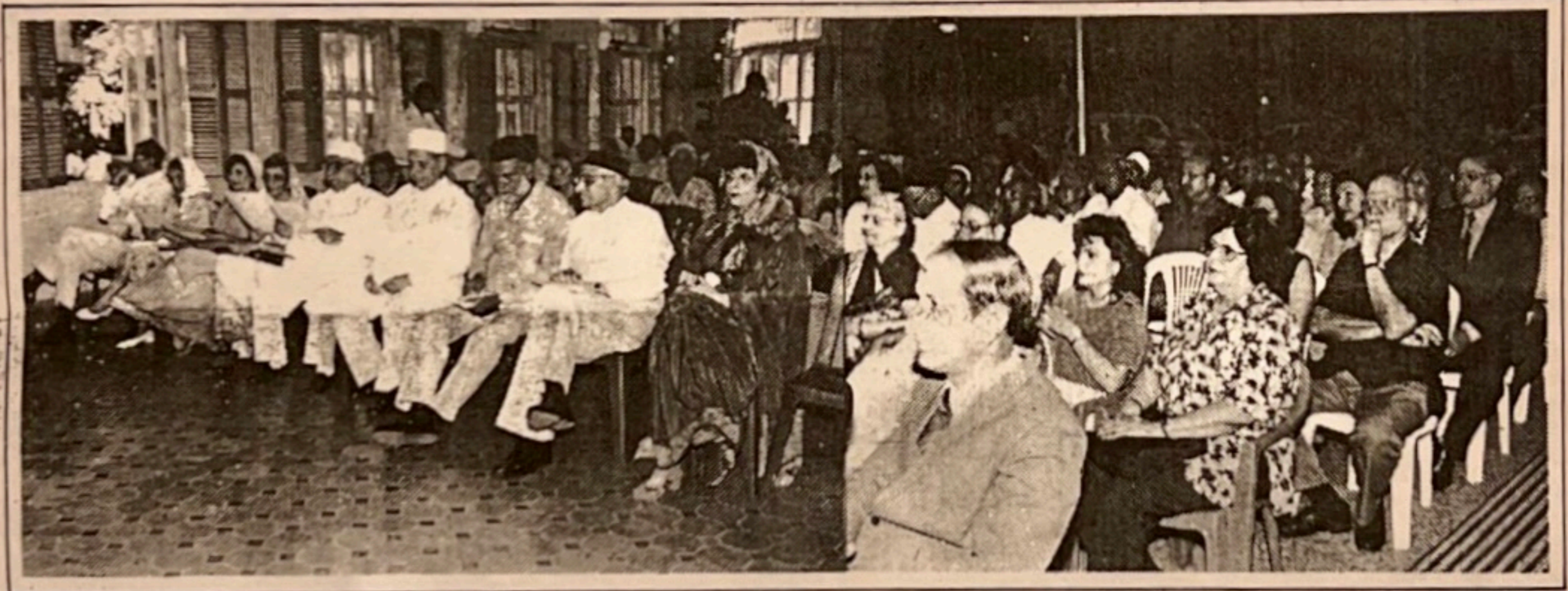
Participants at the YCZA Golden Jubilee function.