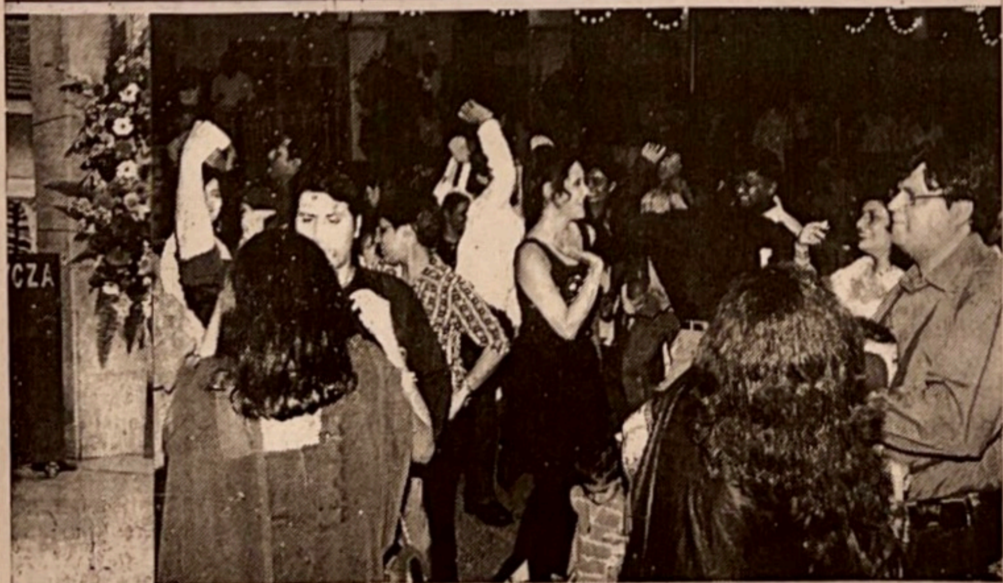
Avabai Petit Youth of the community enjoying themselves. (Photographs: Bomi Patel of Superstar).